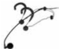
**wireless head mic