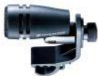
*dynamic clipon mic